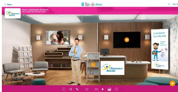
CNAV's virtual stand